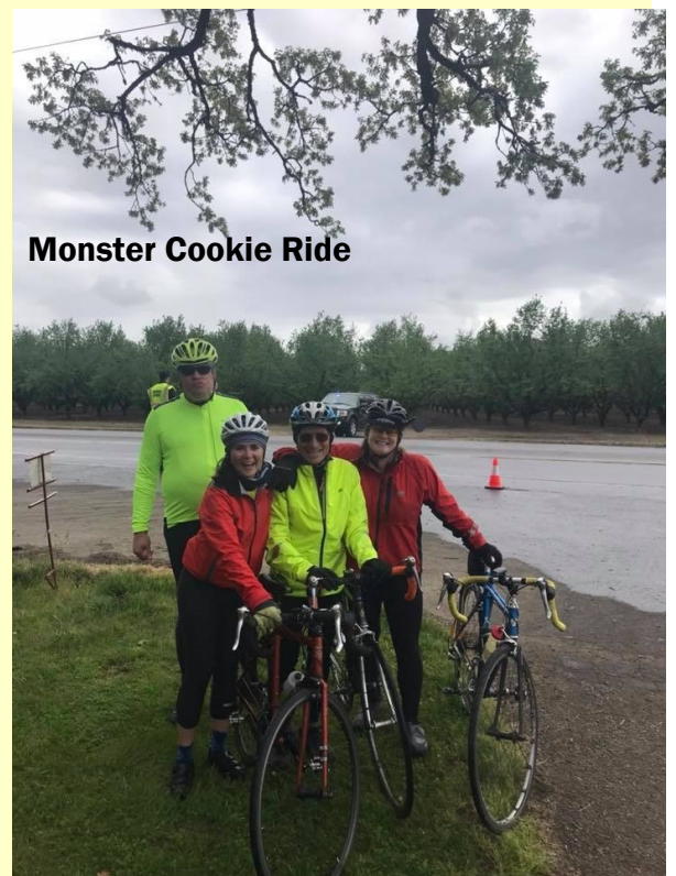
Monster Cookie Ride