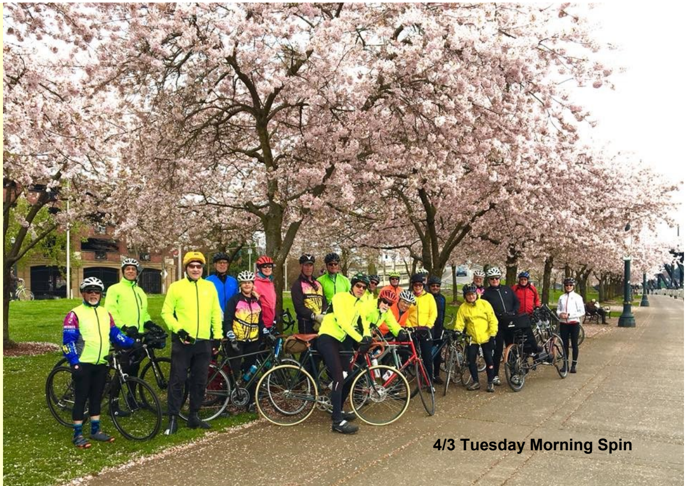
4/3 Tuesday Morning Spin