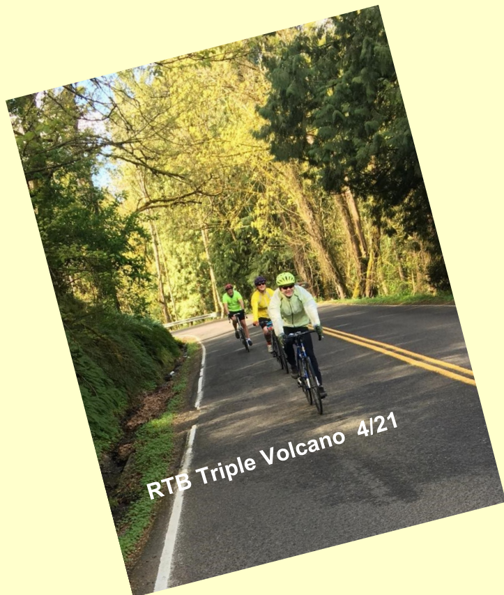
RTB Triple Volcano 4/21